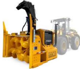
D30 | D40 | D50 | D60