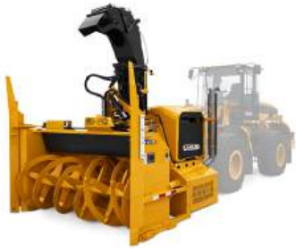
D25 | D35 | D45 | D55 | D65