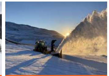
MOUNTAIN PASS OPENING