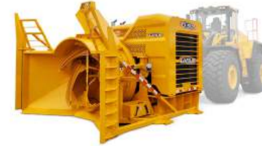
D87 | D97