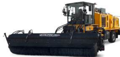
FB18 | FB20 | FB22