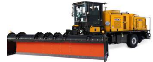
FP18 | FP20 | FP22